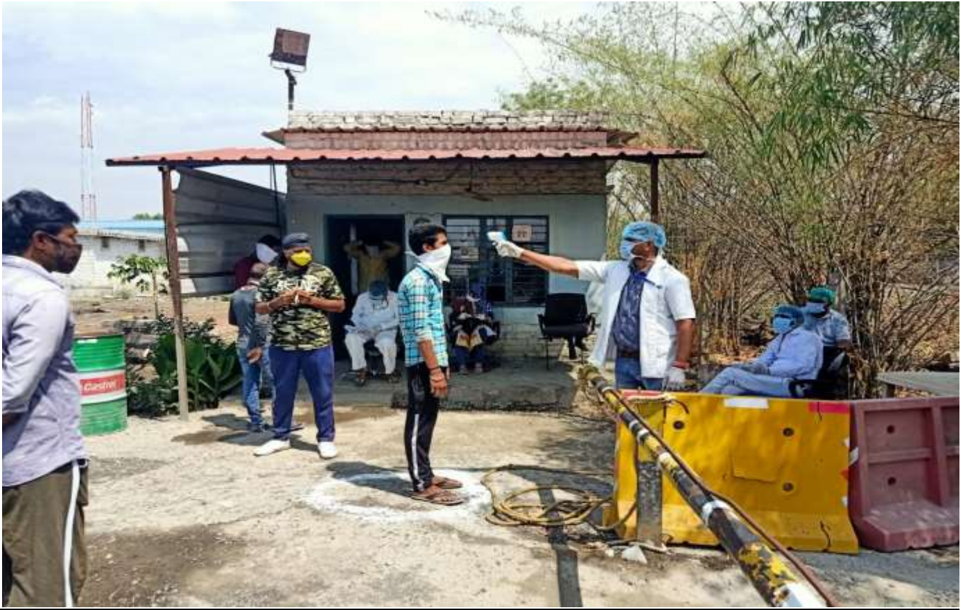
Thermal Testing is conducted at Residential Camp by Medical Team