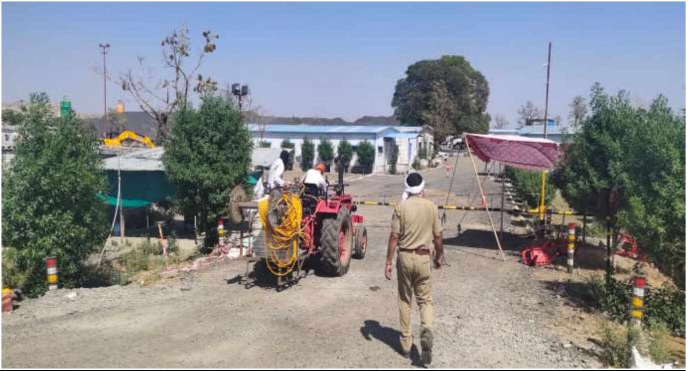
After Carona –Positive Local Administration Monitoring Sanitization