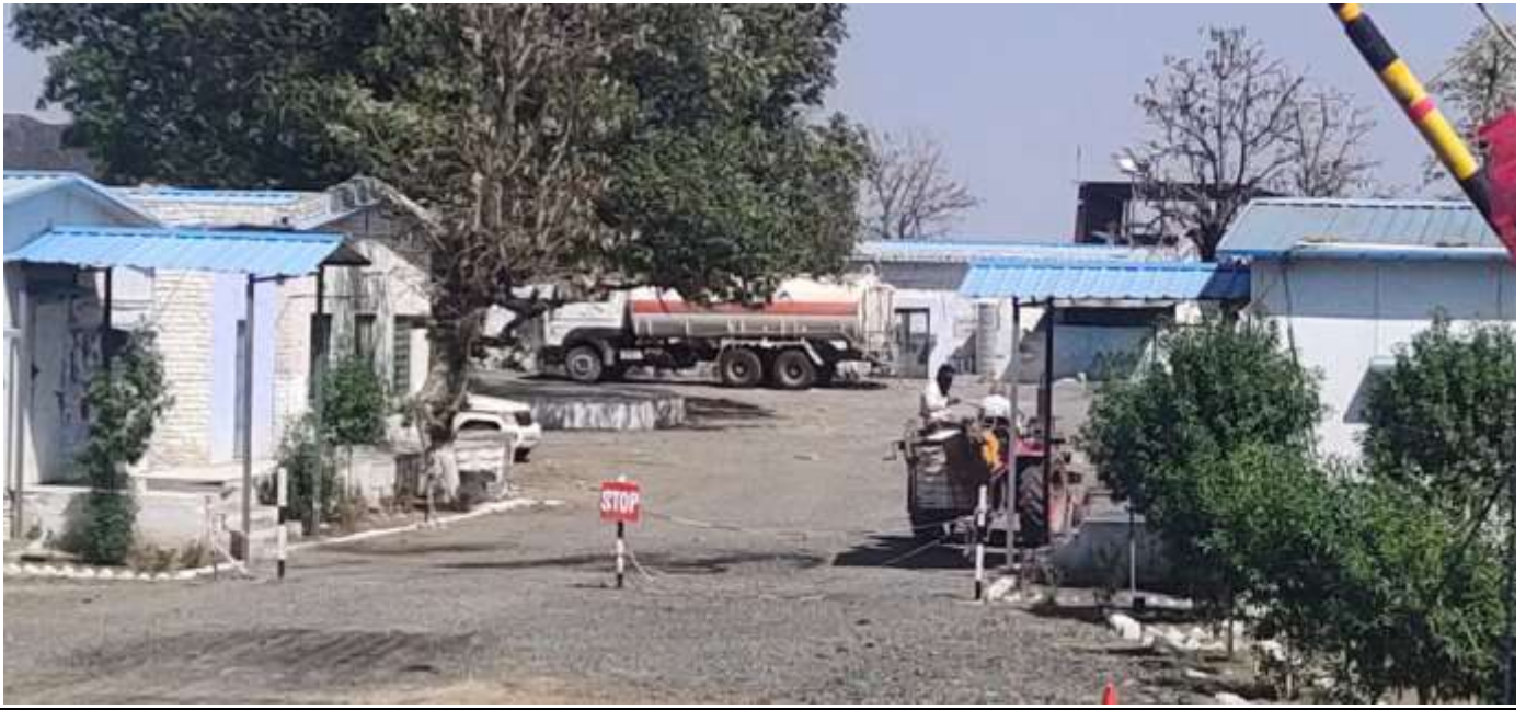
Complete lock down and sanitization work in progress after finding Carona Positive in Camp-1