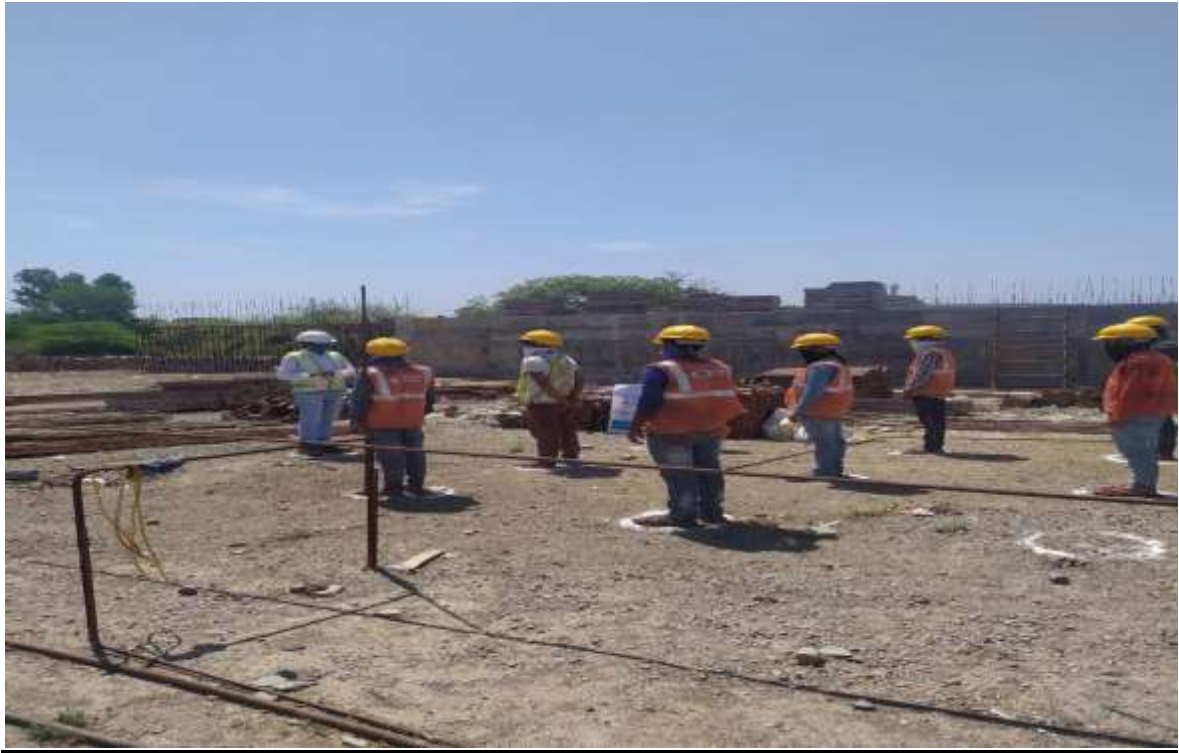
Training for precaution taken during Covid -19