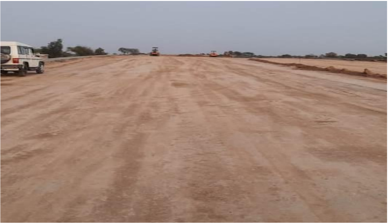
Subgrade 1st Layer at 38+300 to 38+400