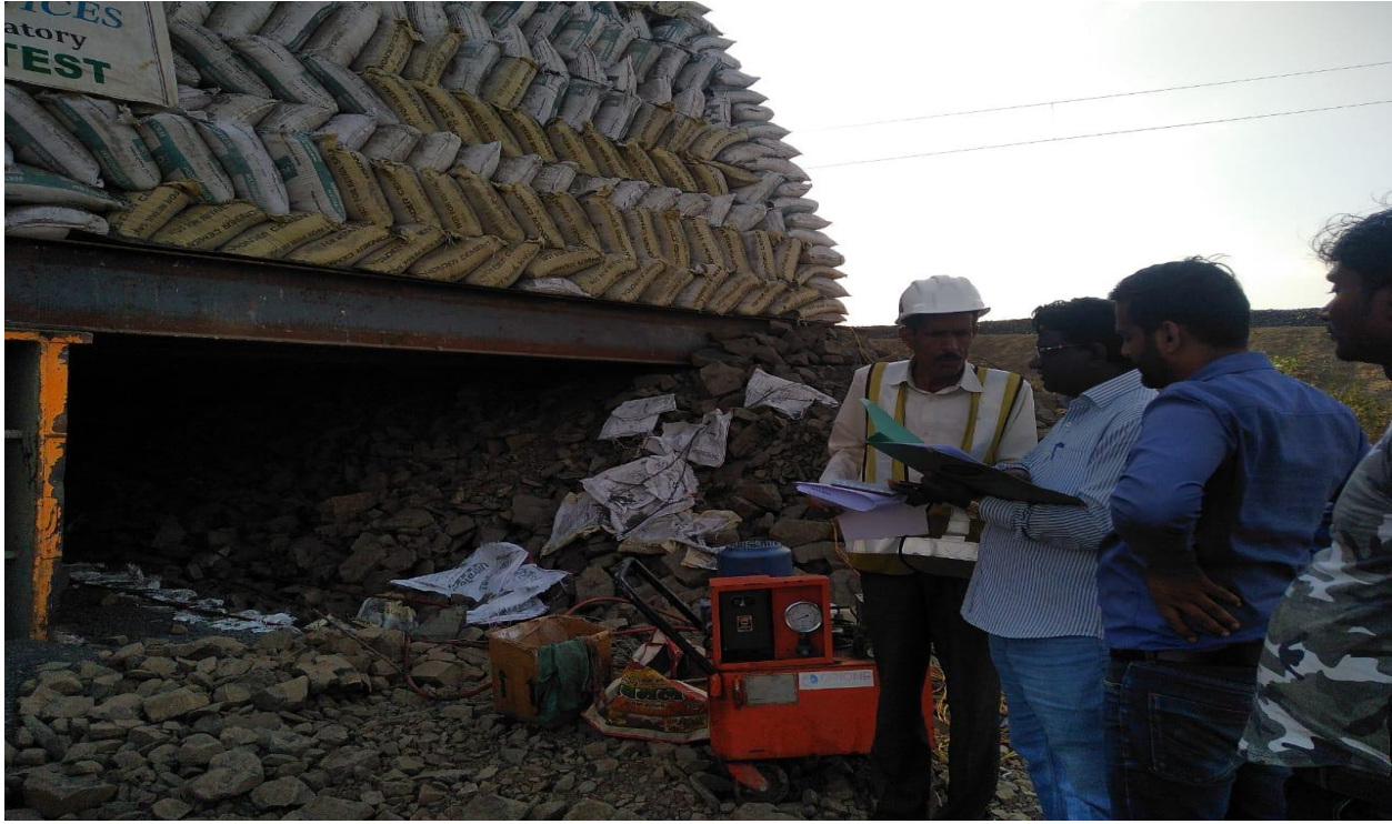
Pile load test on test pile of ROB at ch 44+158