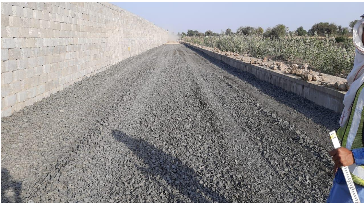
GSB Top Layer at 38+290 to 38+480 SR