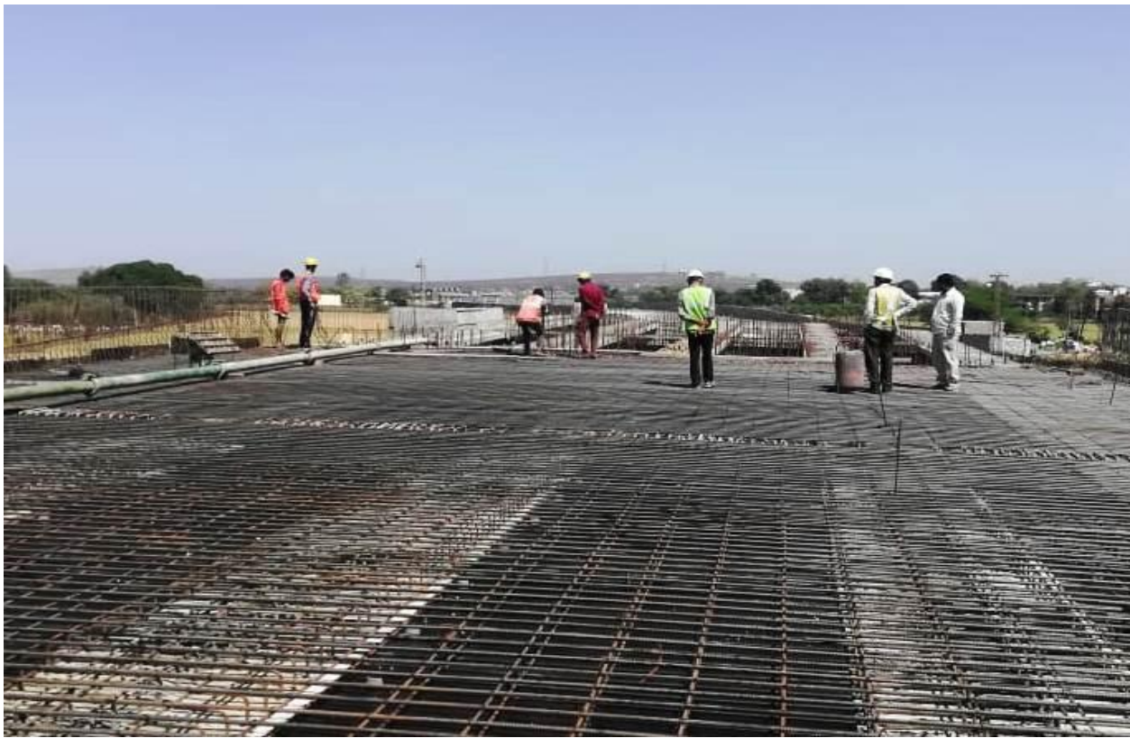
Reinforcement steel & shuttering of slab at ch 47+830 Elevated