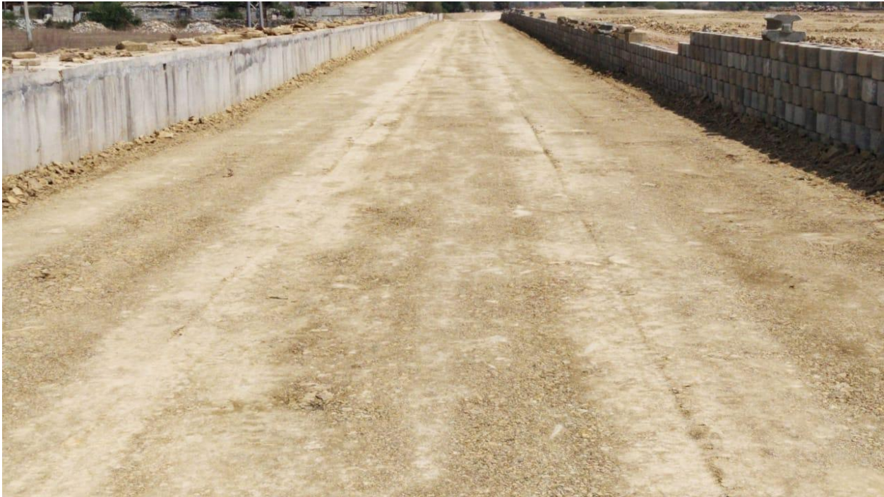
Emb Layer at Ch 26+600 to 26+780 (RHS) SR