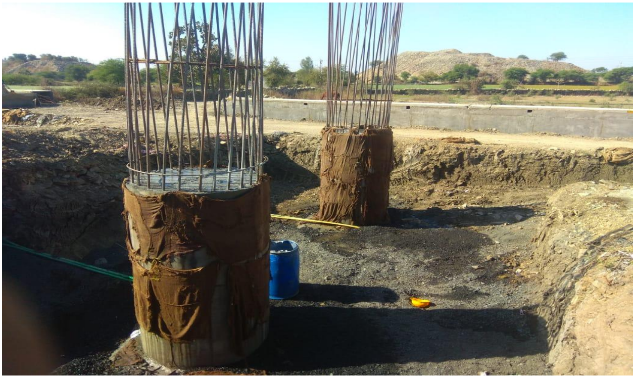
Abutment shaft of VUP at Ch 19+965