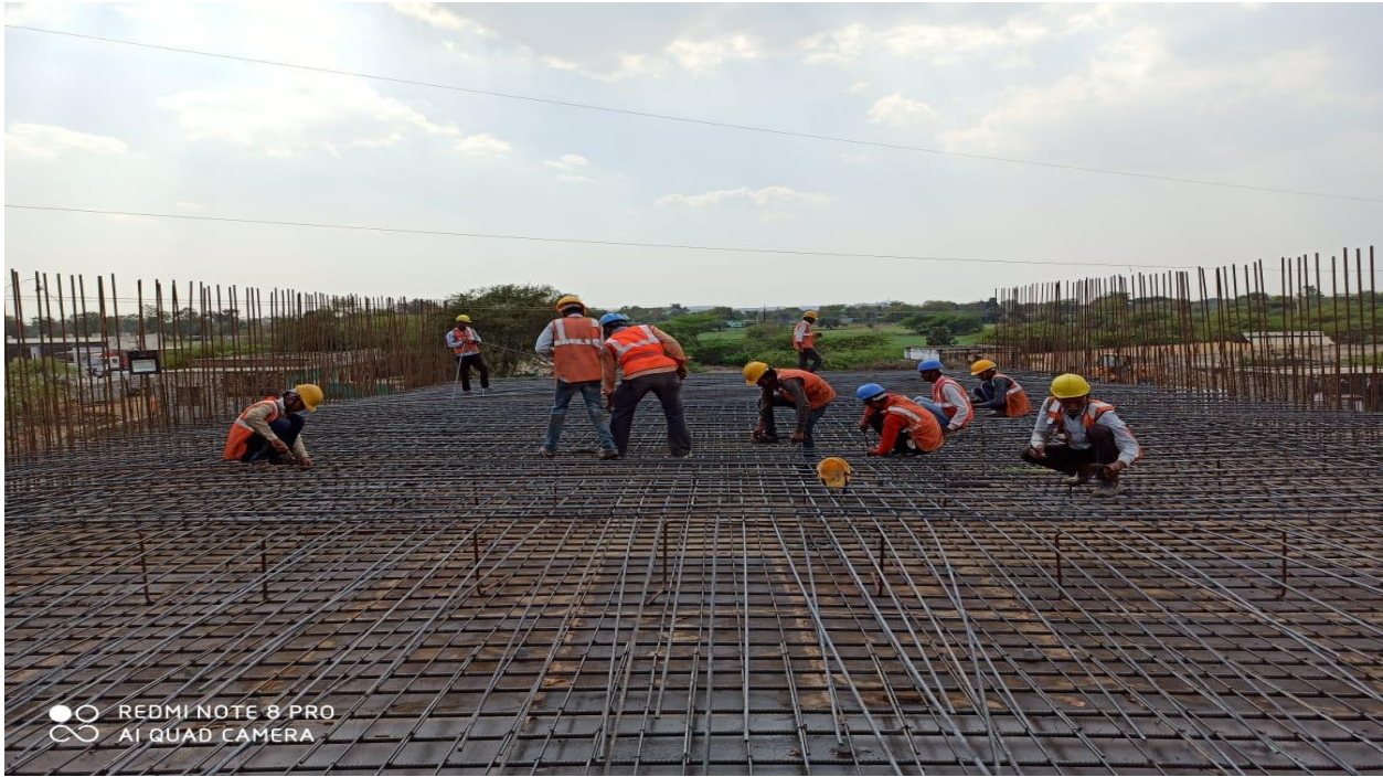
Reinforcement work of slab of LVUP at ch 23+065 (BHS)