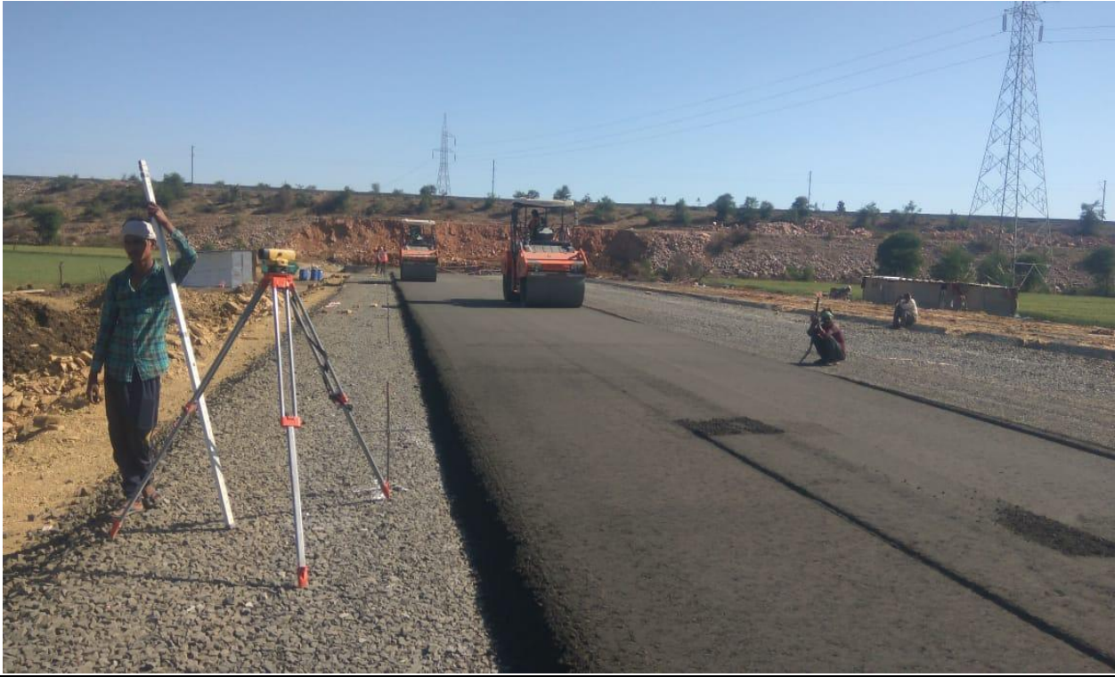
DLC Layer at Ch 33+000 to 33+450 (LHS)