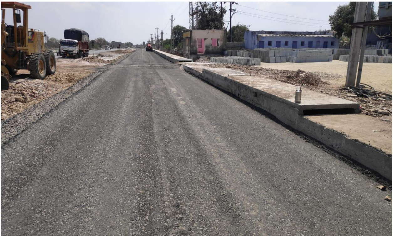
WMM 1st Layer at Ch 23+820 to 24+000 SR (RHS)