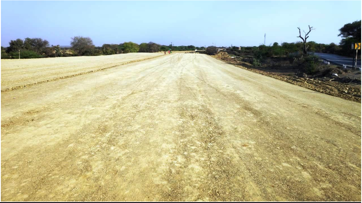
Subgrade 1st Layer at 21+500 to 21+740 LHS