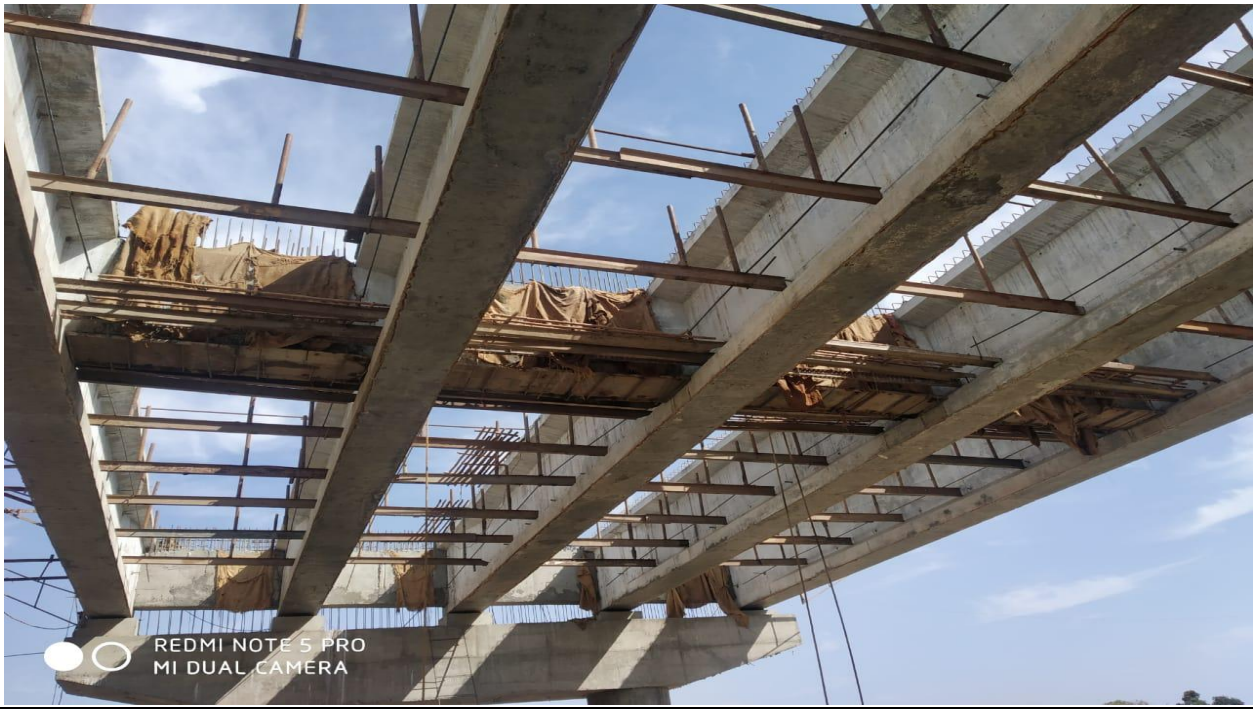
Curing of intermediate diaphragm of VUP at ch 15+725