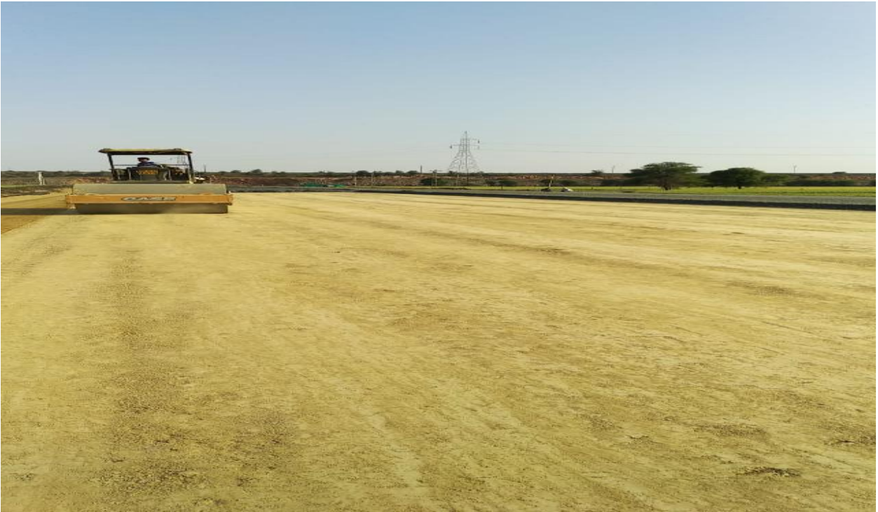
Subgrade Top Layer at 36+700