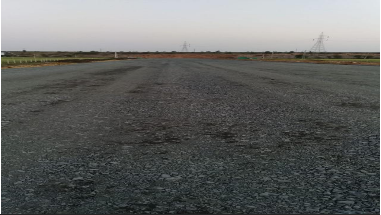
GSB Top at Ch 33+000 to 33+300 LHS