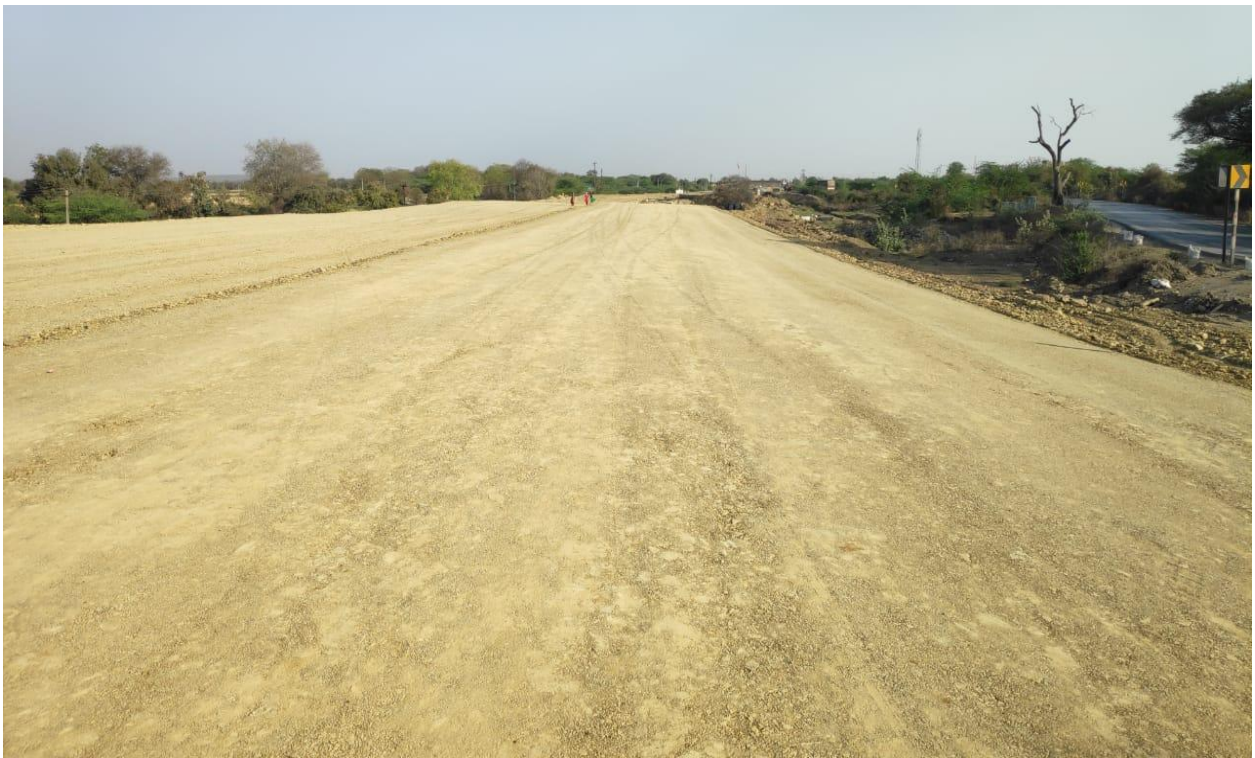
Subgrade 1 st Layer 22+100 to 22+300 RHS