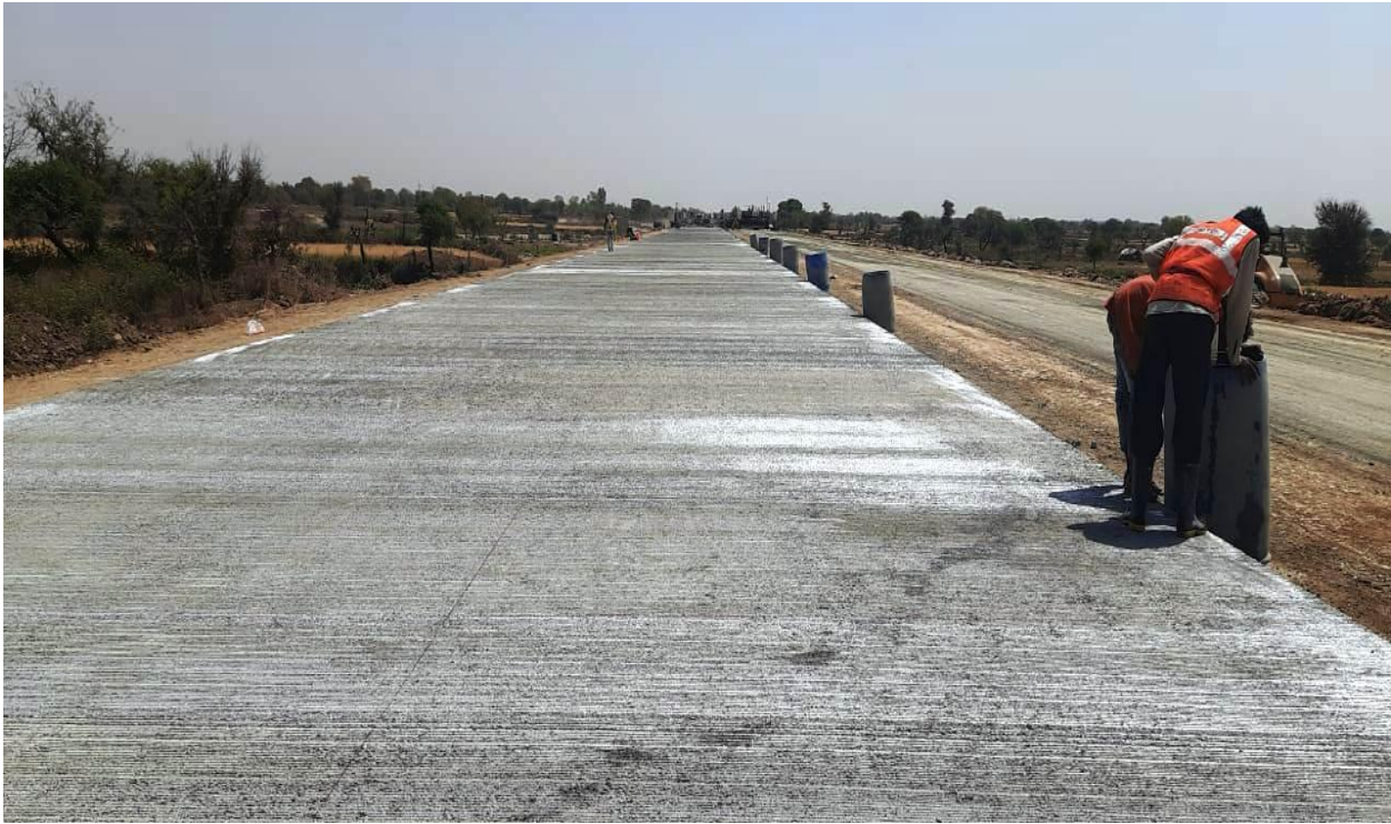
PQC Top at Ch 36+470 to 36+860 LHS