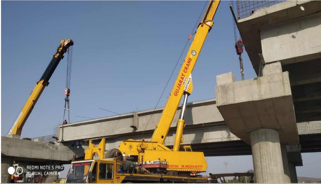
Girder Erection work at Elevated @ Ch 47+830